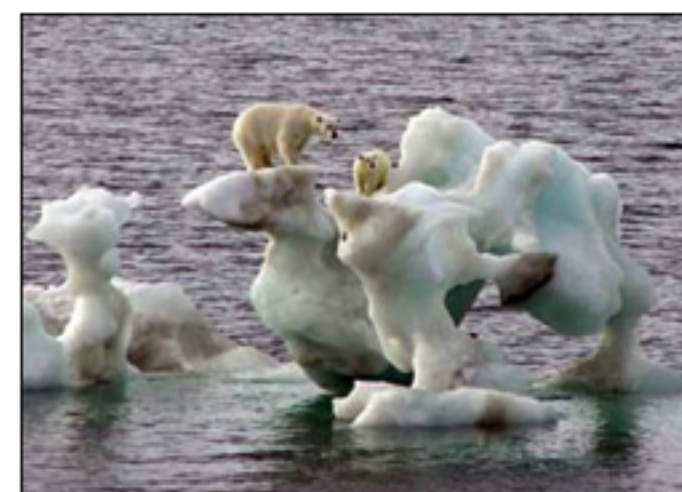
Mother polar bear and cub on interesting ice sculpture carved by waves.