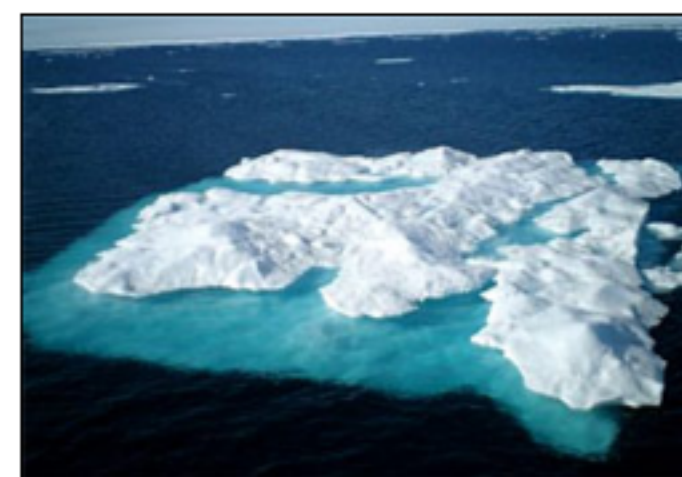
Massive ice block floating free from the main ice pack.